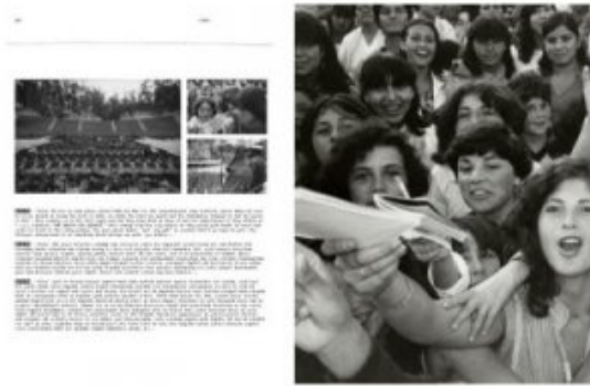
I'll Be Watching You : Inside the Police, 1980-83 de Andy Summ