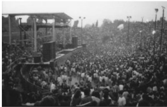
I'll Be Watching You : Inside the Police, 1980-83 de Andy Summ